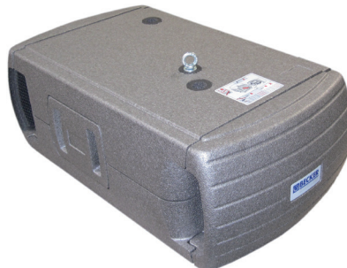
Rotary vane pump in sound proof box SH19/SH20