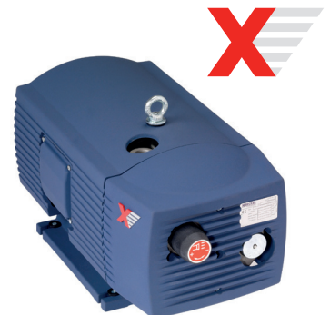
Rotary vane vacuum pumps VX 4.25 of the X-Series